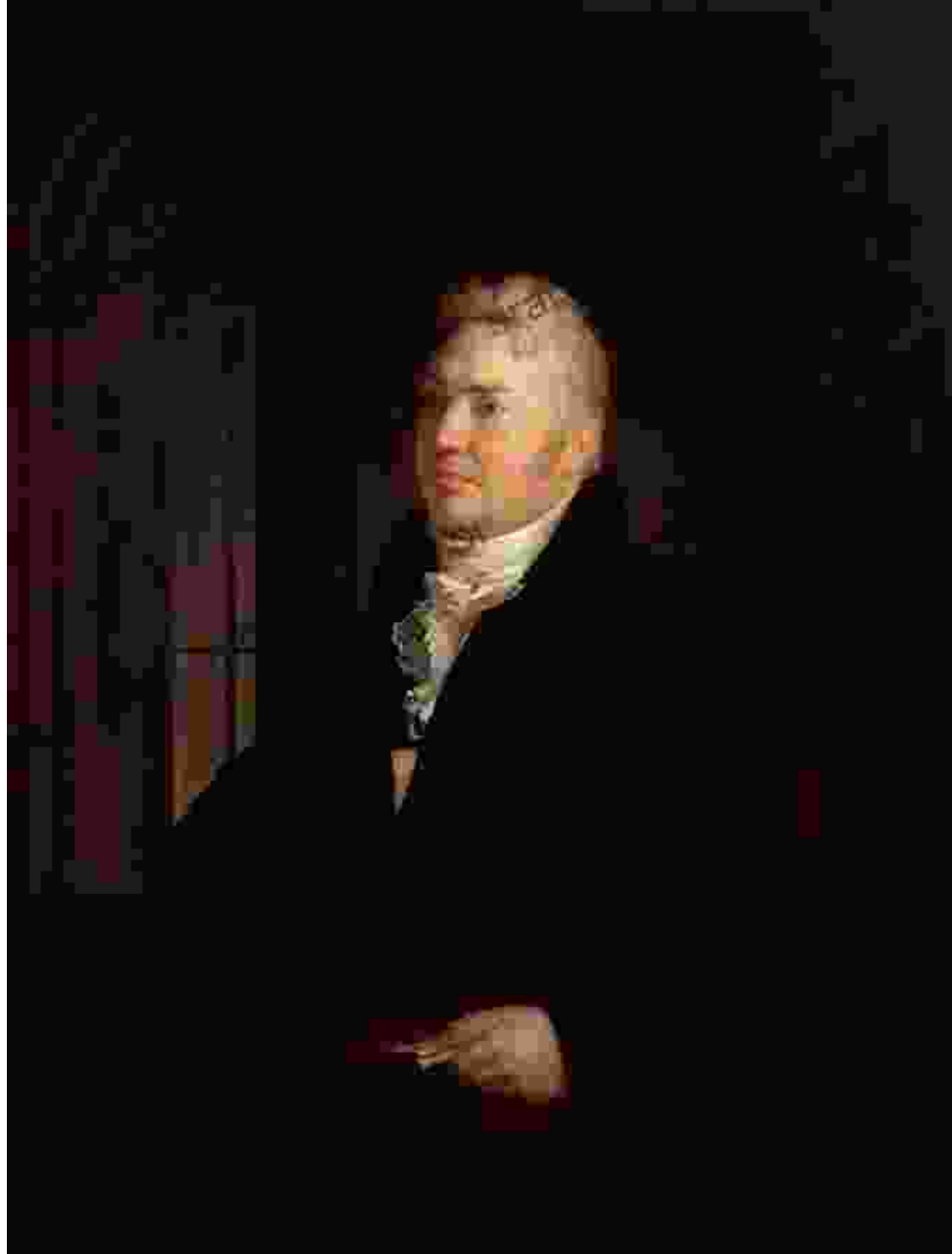
Samuel Taylor Coleridge

Coleridge's late poetry delved into the realms of the supernatural, dreams, and the power of imagination. His vivid imagery and haunting rhythms evoke a captivating world that transcends reality.