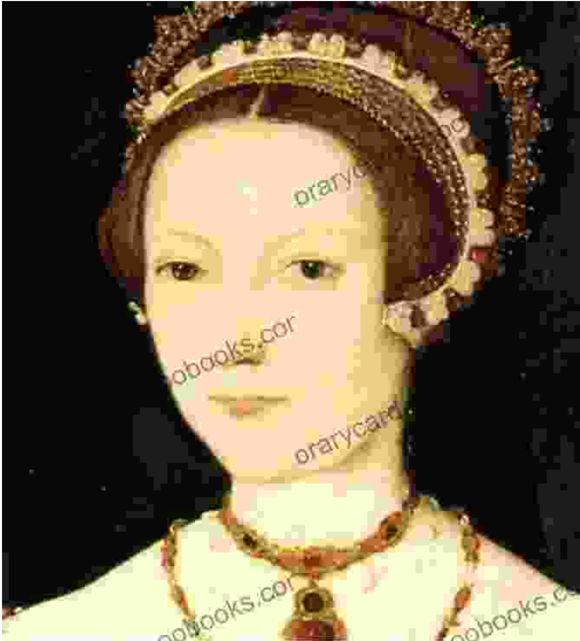
Catherine Parr, the sixth wife of Henry VIII