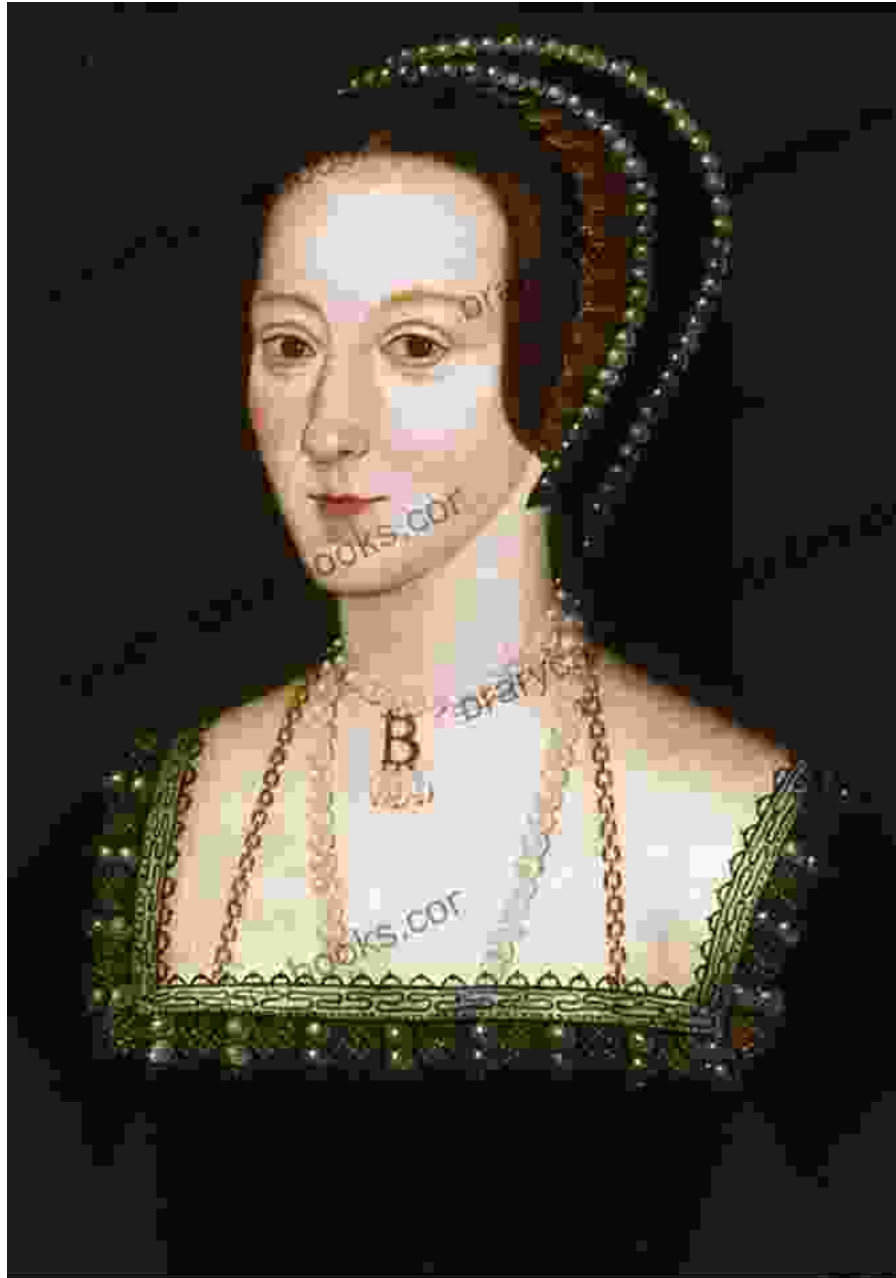
Anne Boleyn, the second wife of Henry VIII