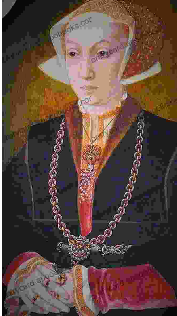
Anne of Cleves, the fourth wife of Henry VIII