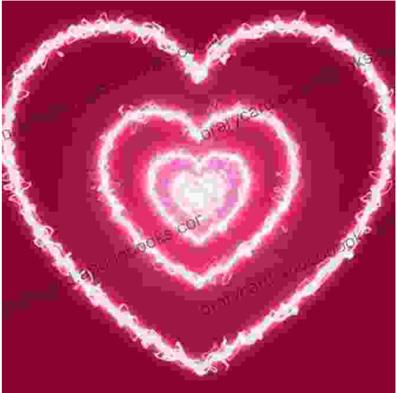
The Spiritual Significance of Words